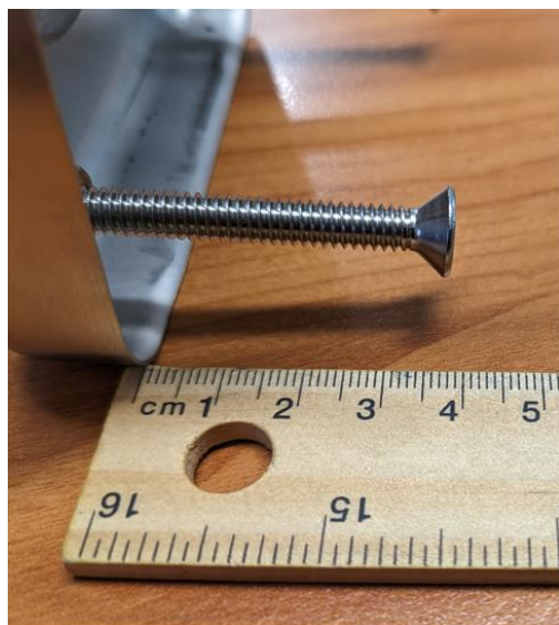
Diagrams 2 & 3. 70mm (centre to centre) mounting holes – vertical and horizontal