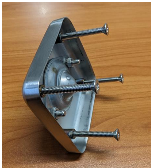
Diagram 1. Rear mounts, maximum screw depth 35mm (from the rear side of the hook). Should be fixed to a suitable substrate.